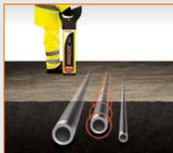
1 Conduct ground survey gathering data

See better results, more comprehensive ground surveys and a reduction in buried service strikes.