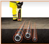
5 Implement changes to procedures for better results