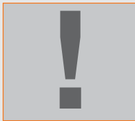
4 Make informed decisions to efficiently manage EZICAT fleet and operators