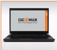
2 Send logged data to Bluetooth® enabled PC