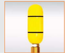
Dual Frequency Sonde

Compact dual frequency signal transmitter used to trace drains, sewers and other non conductive services. The Sonde can be attached to a range of equipment including drain rods, boring tools and inspection cameras.